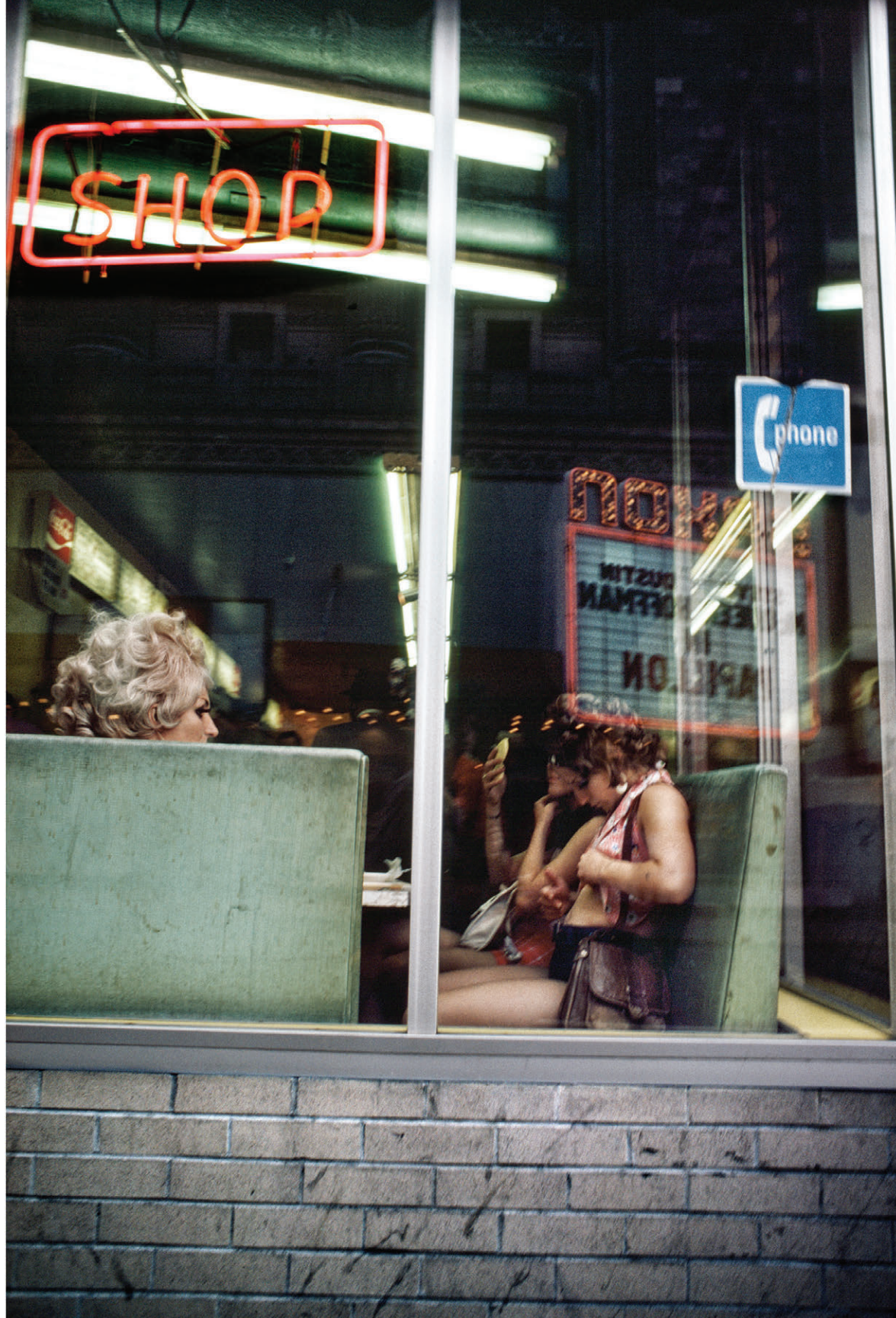
Coffee Shop / Combat Zone / Boston 1973