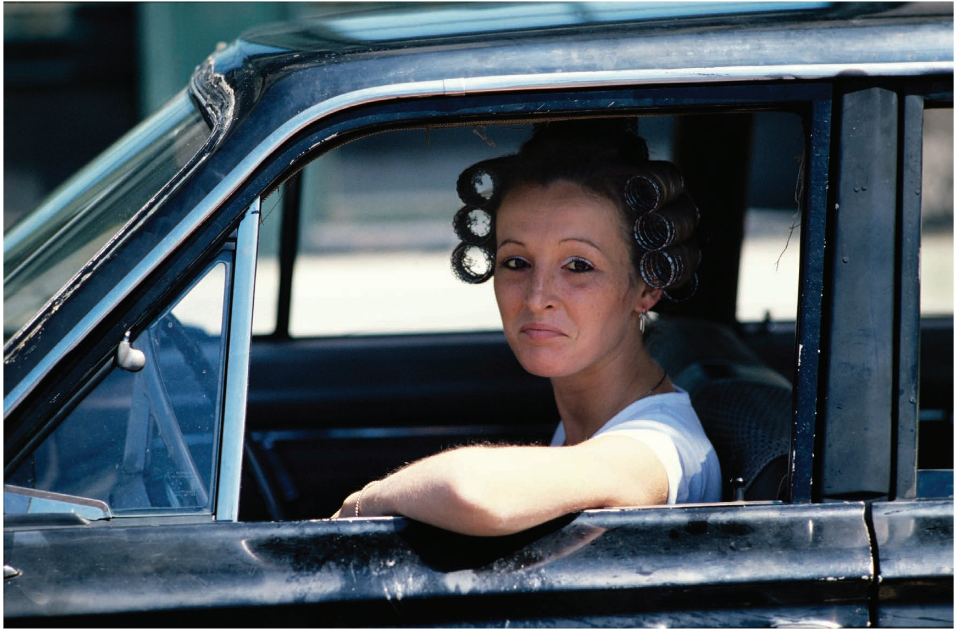
Woman Driver / South Boston July 1977