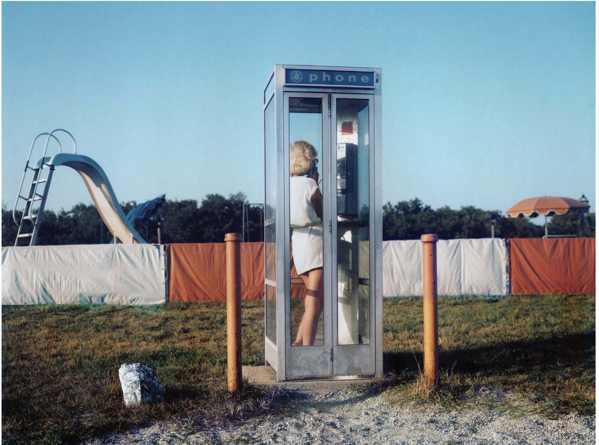
above: Sea View Motel / Truro 1980 cover: Painted Ladies / Combat Zone Boston 1979