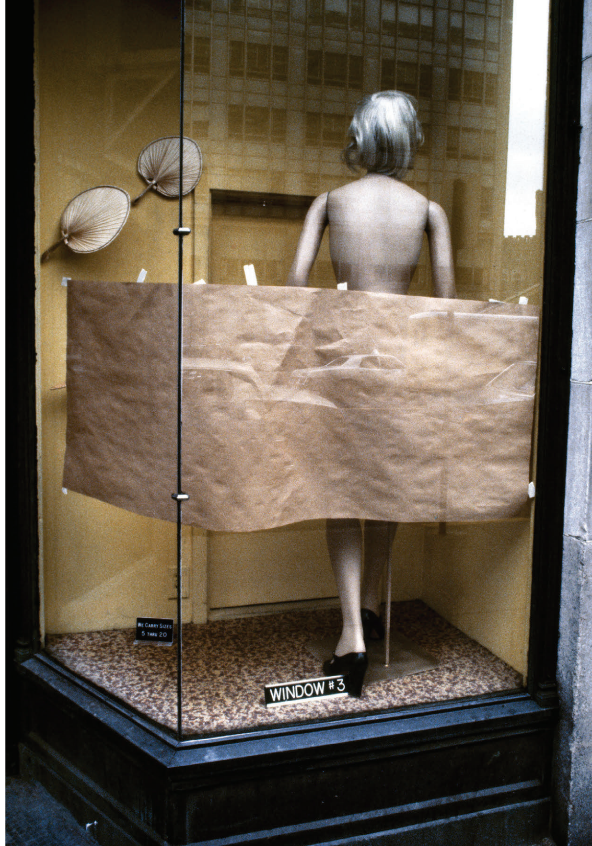
Window #3 / Boston 1978