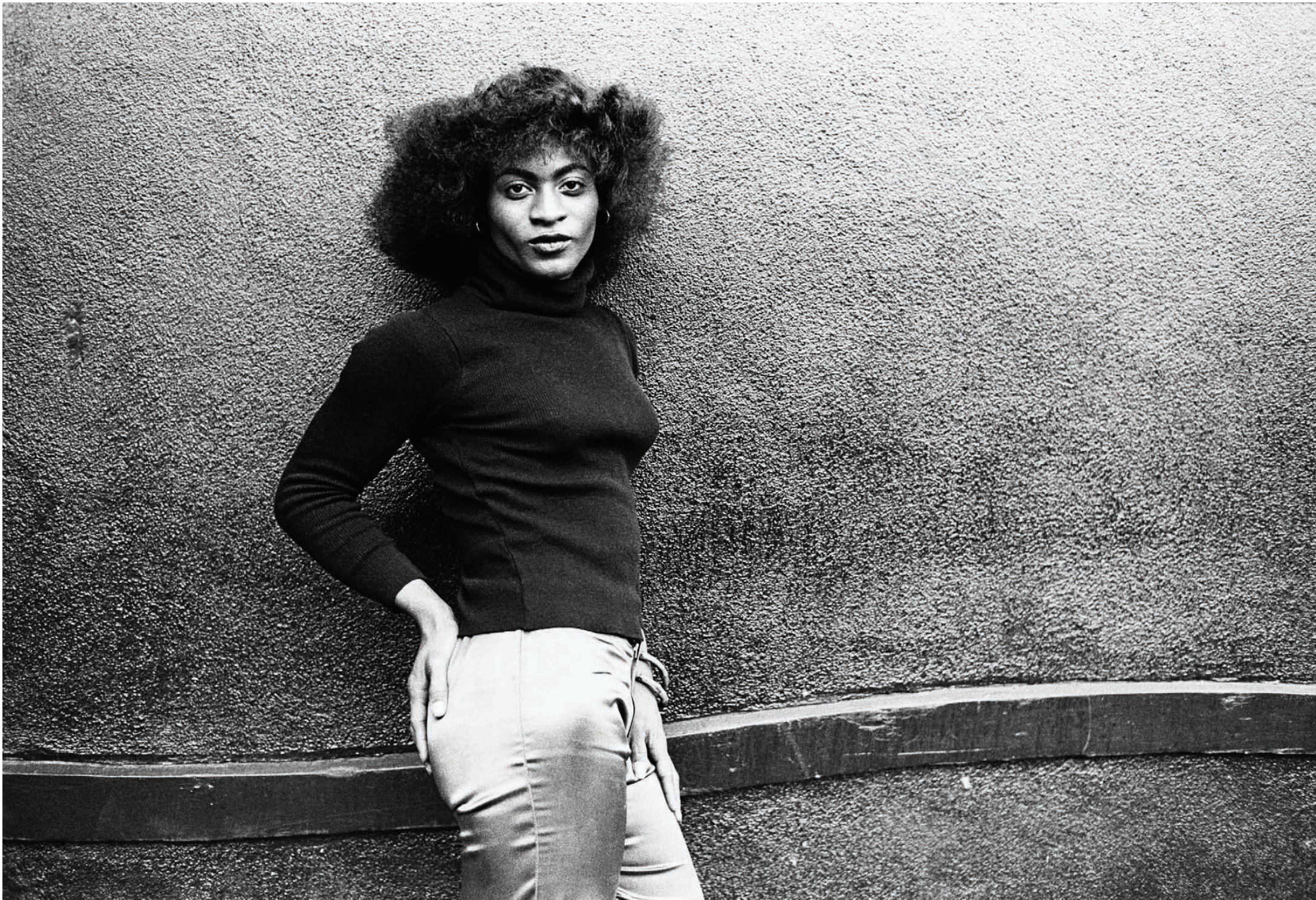
The Other Side / Bay Village October 13, 1978