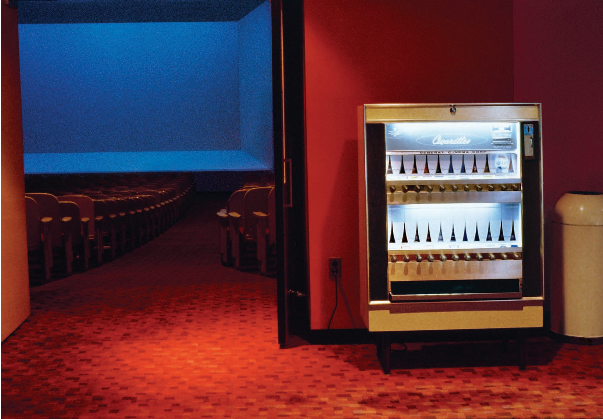
General Cinema / Framingham, Mass. 1985