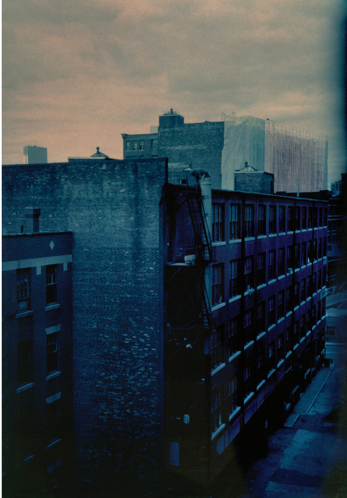
Blue Summer 337 / Fort Point 1992