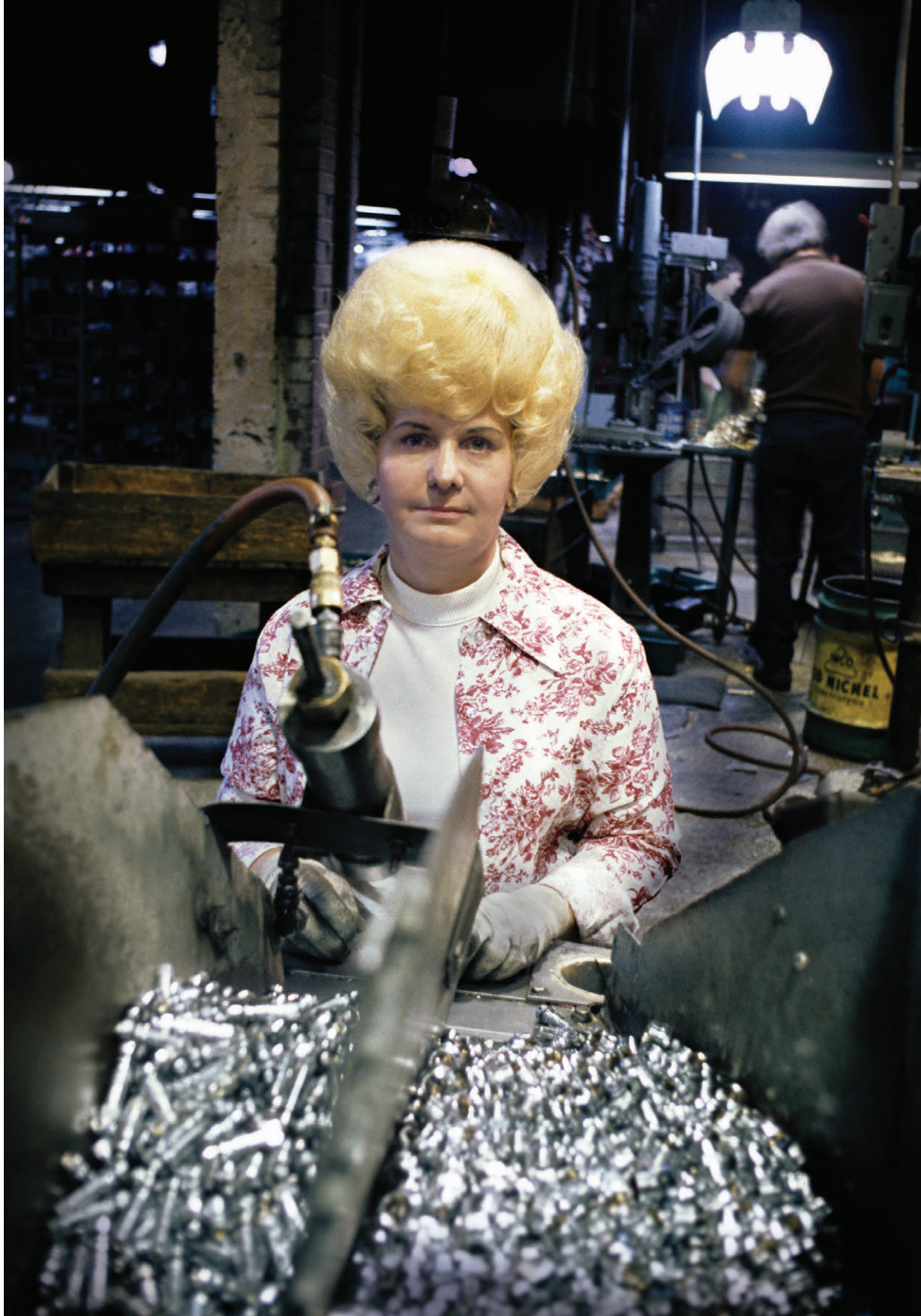
Morgantown, West Virginia 1974