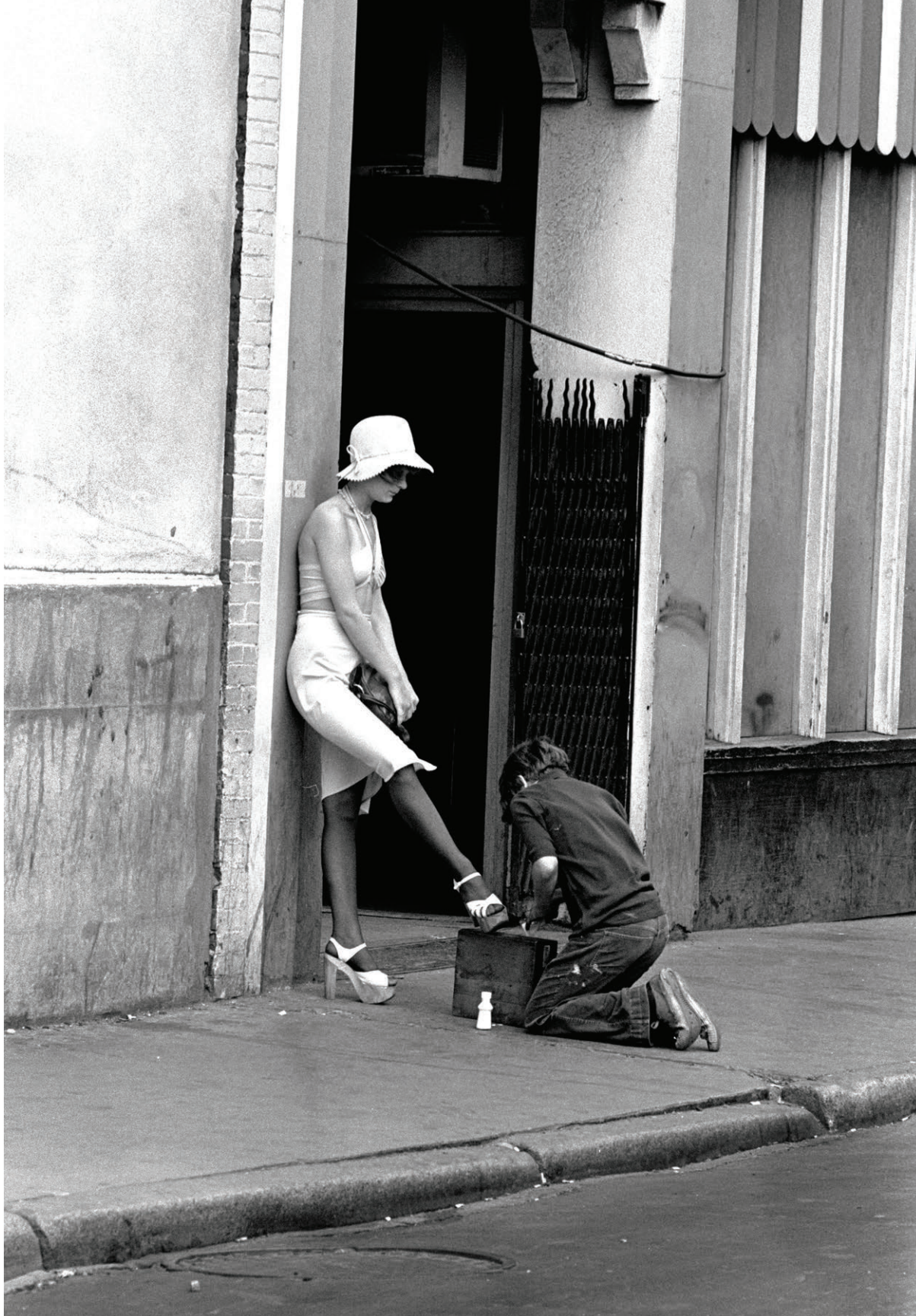
Shine / La Grange Street May 1975