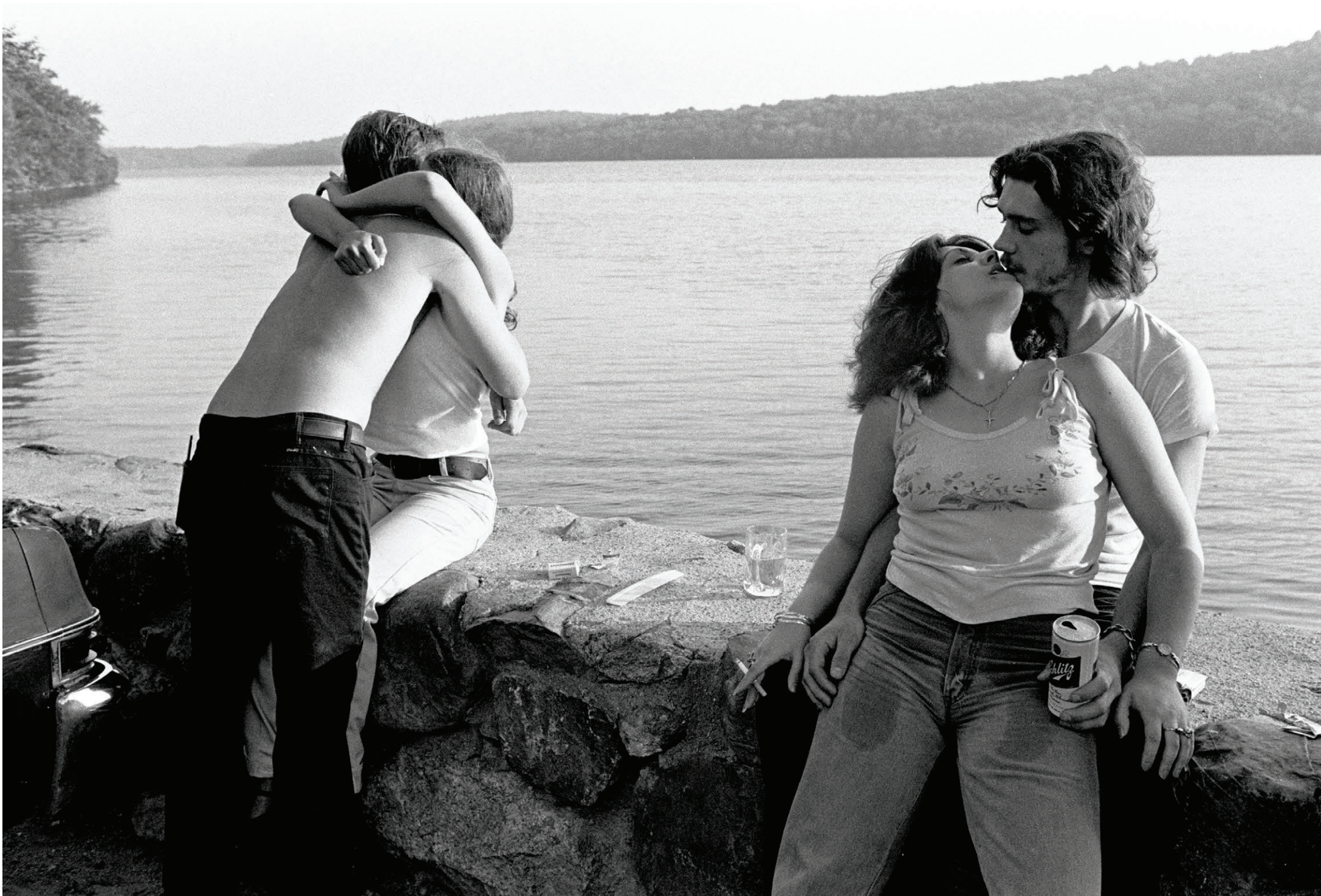
Quabbin Reservoir 1980