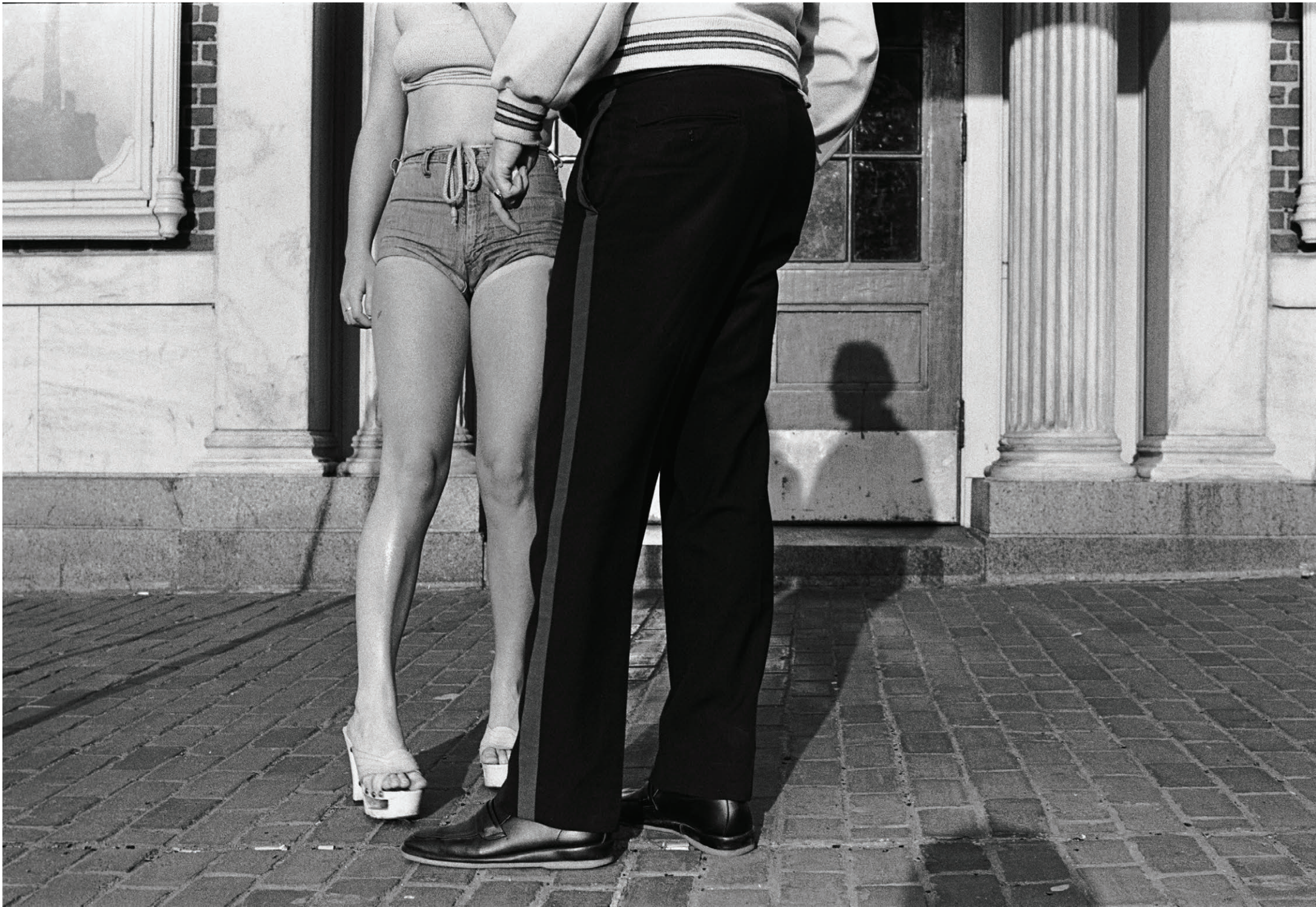
Tremont Street #4 June 12, 1978