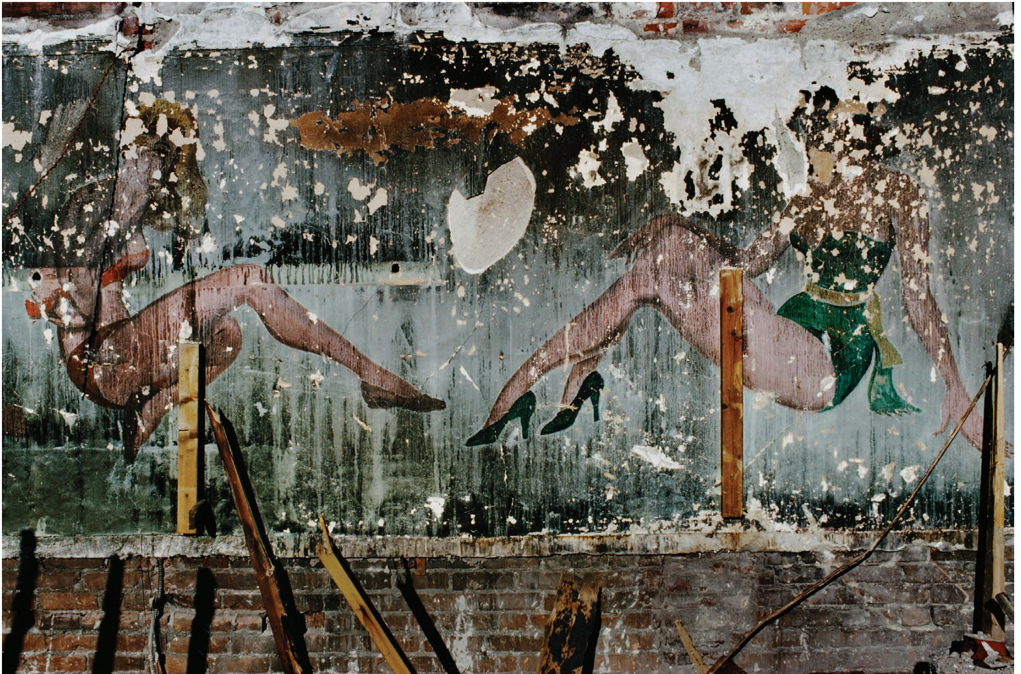
JOHN GOODMAN not recent