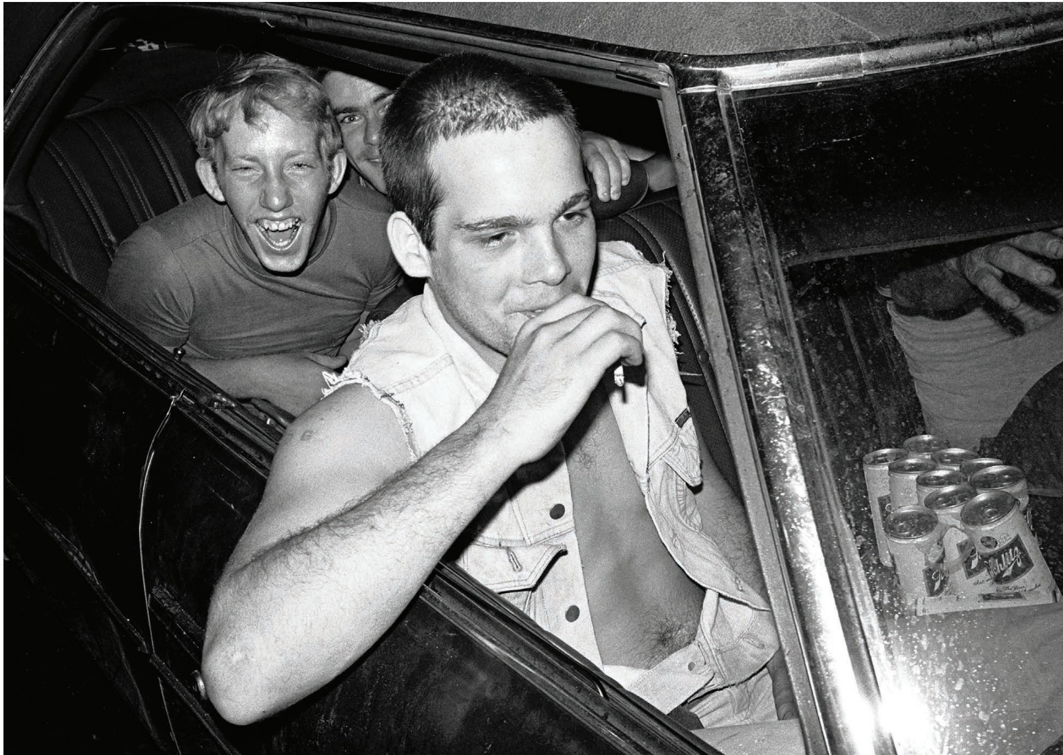
The Schlitz Boys / Boston July 28, 1978