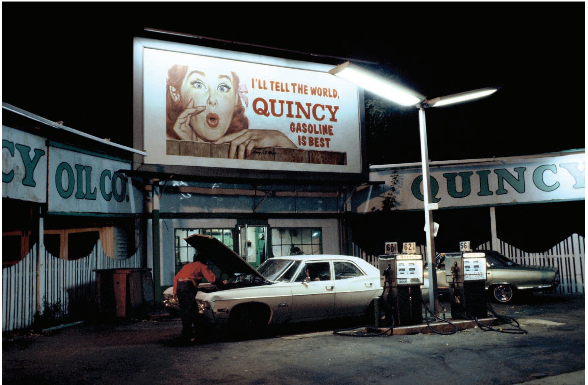
Quincy Gas 1973