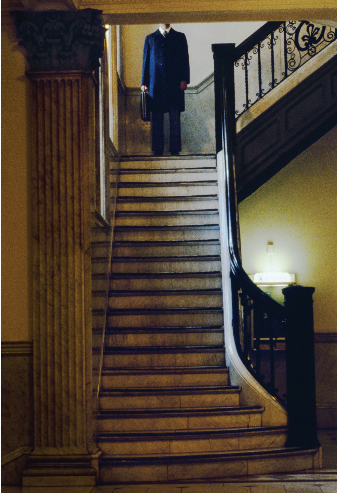
Statehouse / Boston 1979