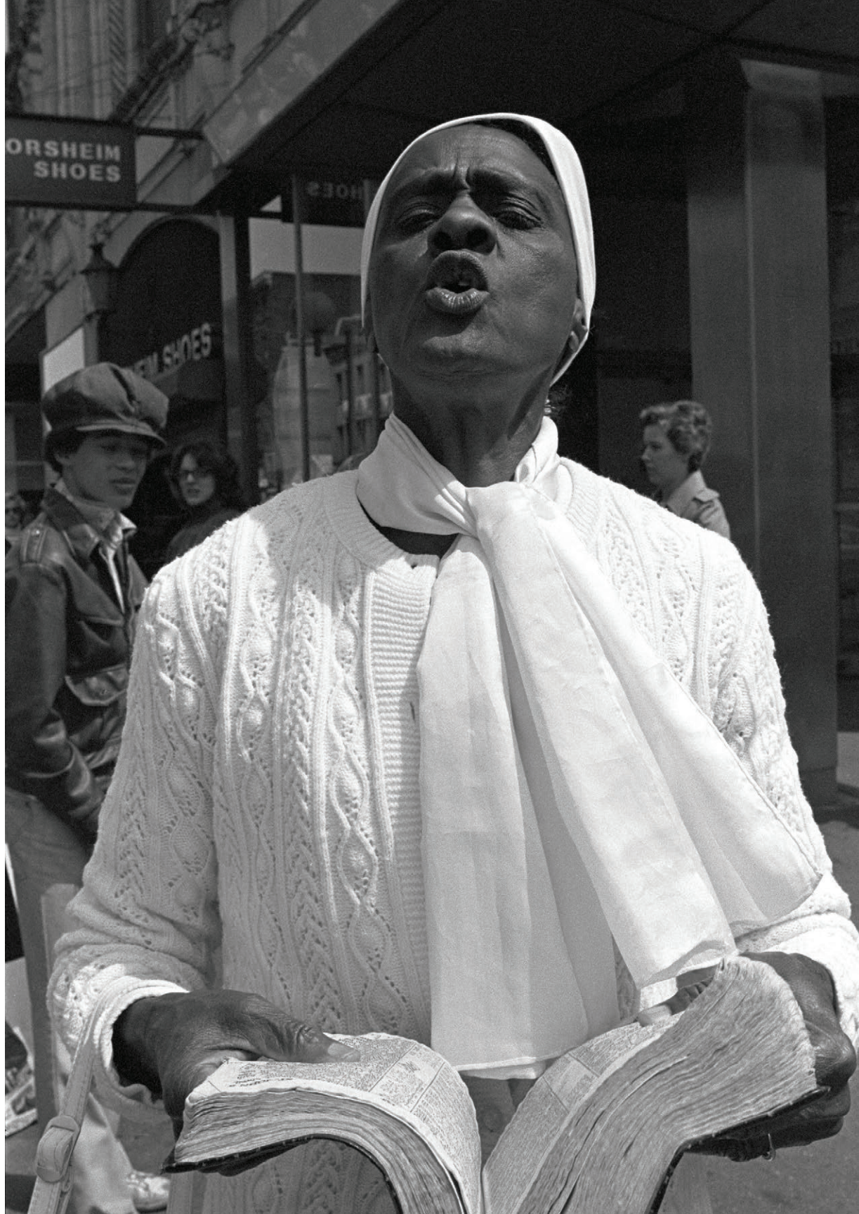
Preacher / Boylston Street April 1976