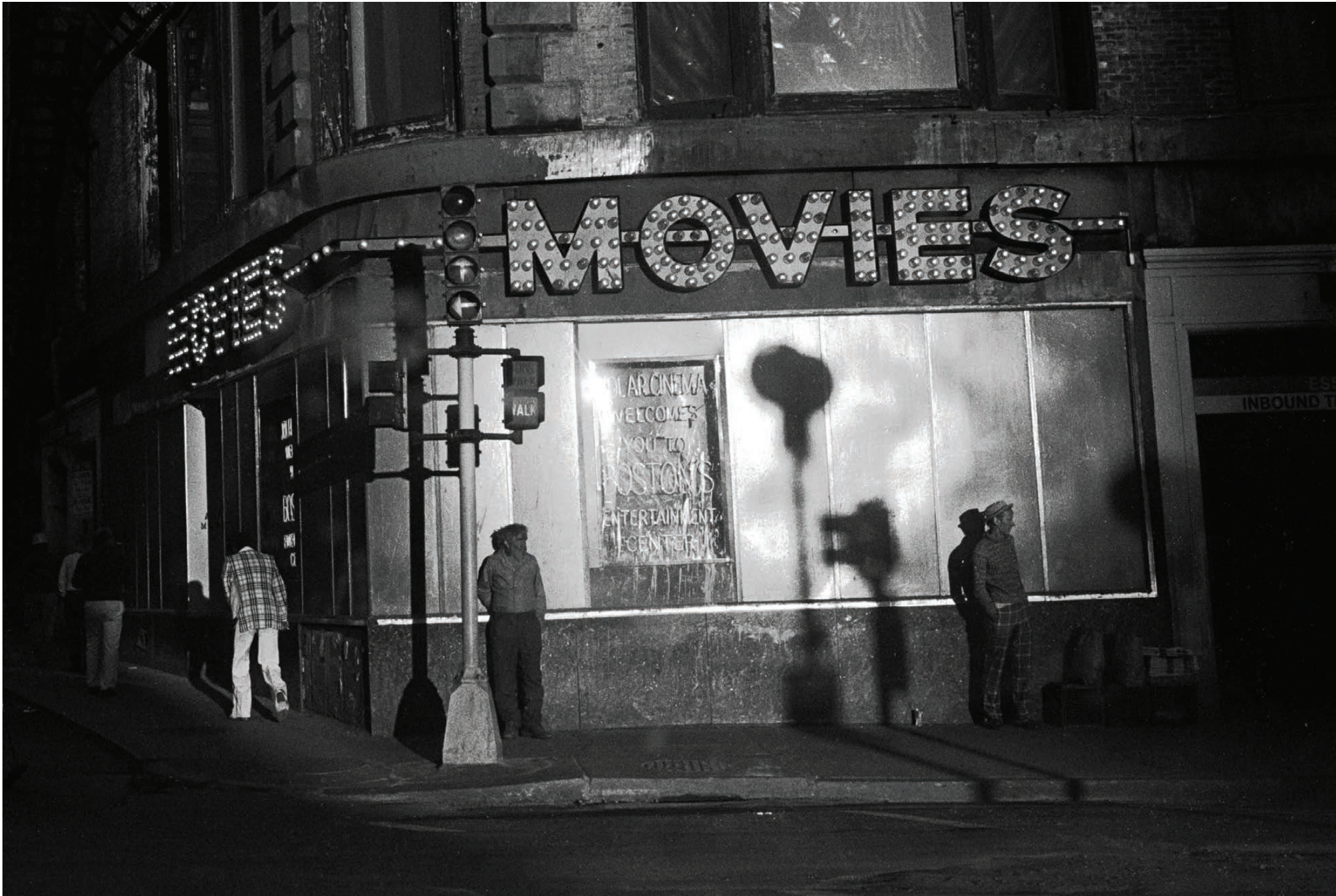
Movies / Combat Zone / Boston September 12, 1975